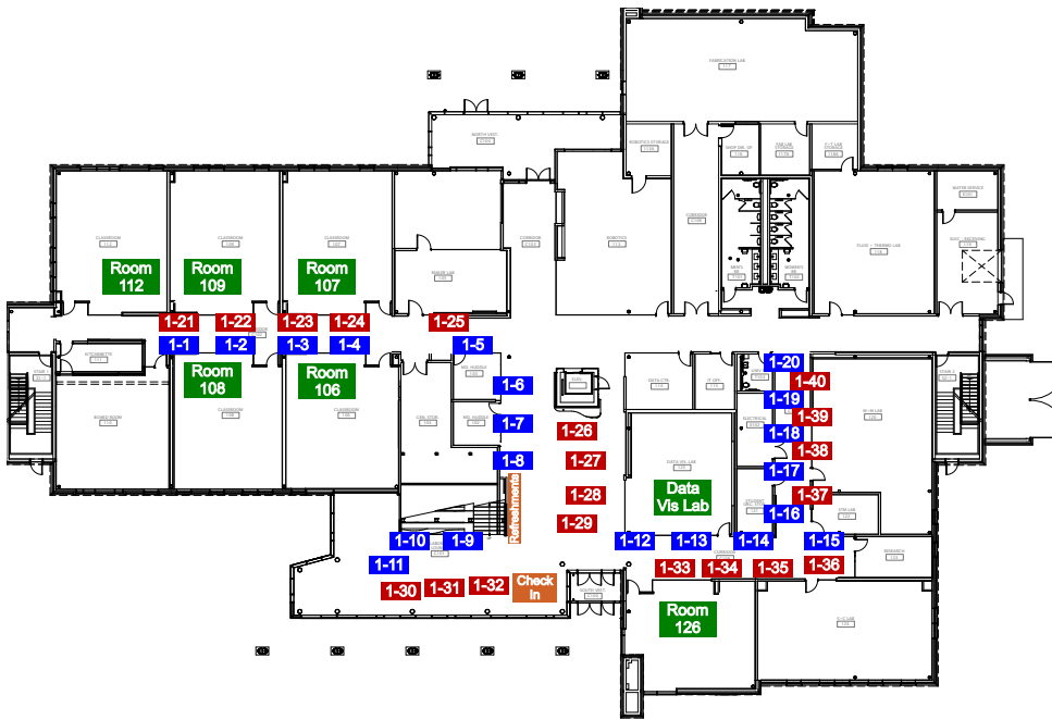
KNOWLTON CENTER - FIRST FLOOR PLAN