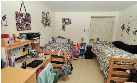
Private bedroom – view 1

Participants who choose to stay on campus may move in as early as July 20, 2018. Participants must check-out by Monday, July 30, 2018.