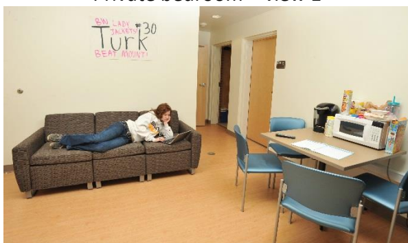
Shared living space