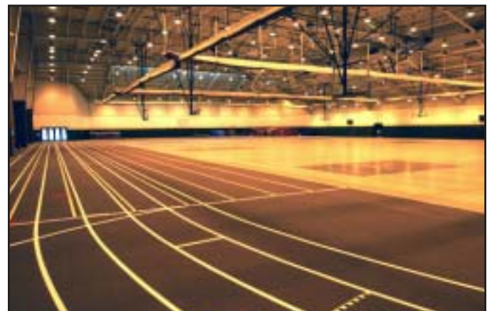
The Harrison Dillard Track in the B-W Fieldhouse is a six-lane, 200-meter oval that has served as the site of many B-W, OAC, high school and amateur championship meets.