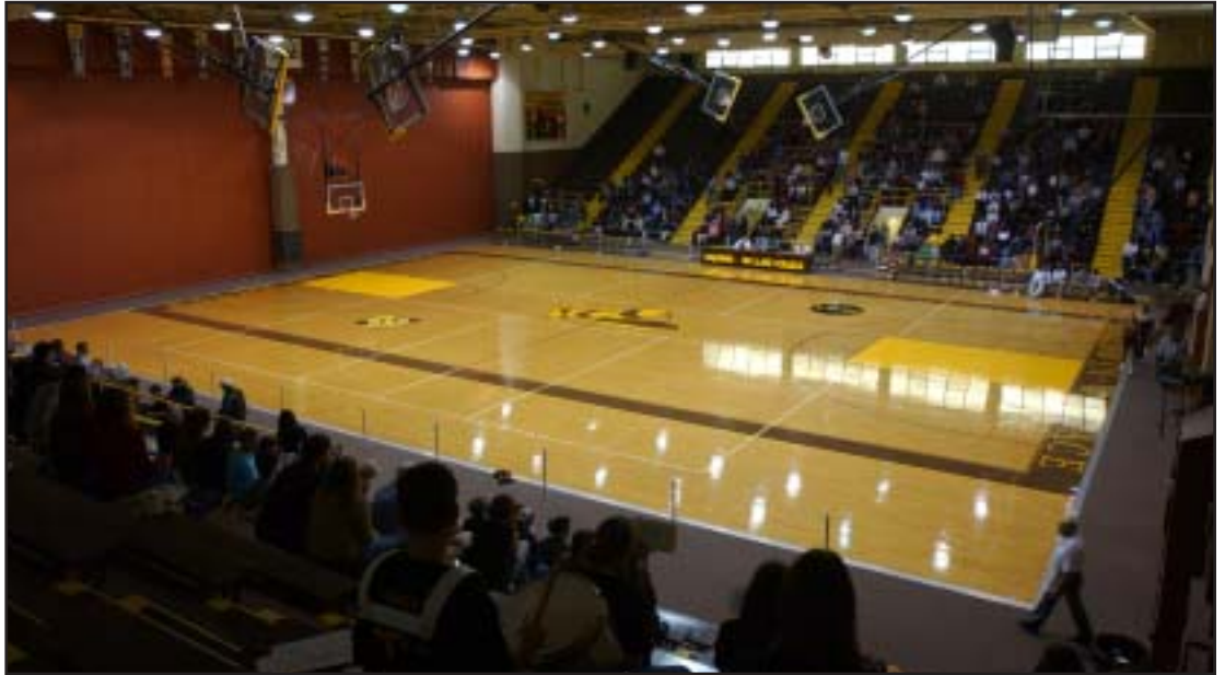
The Ursprung Gymnasium was renovated in 1986 and seats more than 2,800 fans for basketball, volleyball and wrestling. The basketball stands are situated away from the floor with an excellent view from any angle.

courts that can be used individually or in tandem for volleyball, basketball, tennis and other activities. On many occasions, the B-W basketball team has been playing a game while a wrestling match or an intramural basketball game was taking place in