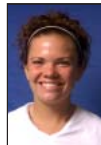
Sophomore Psychology Defender 5'8" Stow, Ohio Stow-Munroe Falls High School