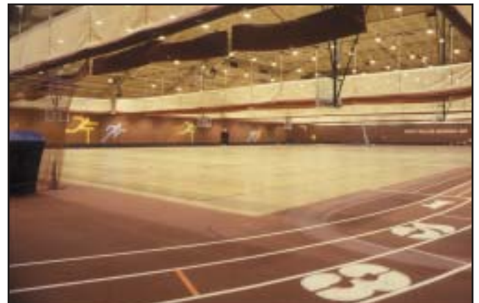
The Harrison Dillard Track in the B-W Fieldhouse is a six-lane, 200-meter oval that has served as the site of many B-W, OAC, high school and amateur championship meets.