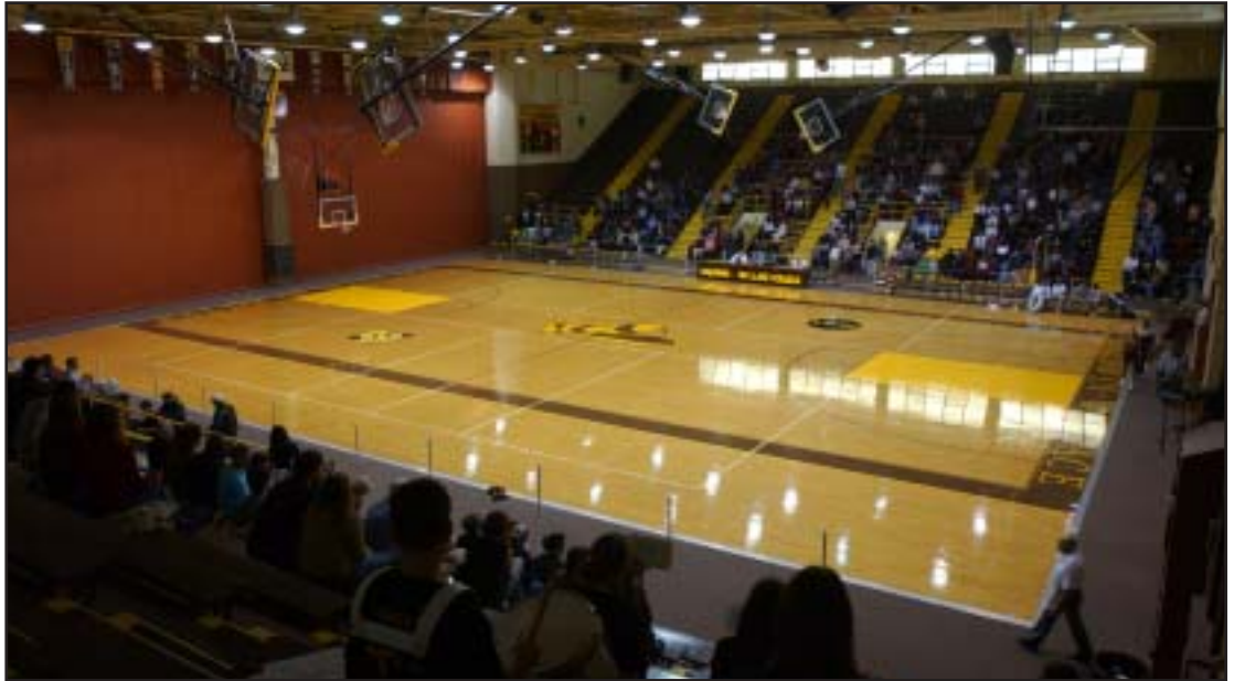
The Ursprung Gymnasium was renovated in 1986 and seats more than 2,800 fans for basketball, volleyball and wrestling. The basketball stands are situated away from the floor with an excellent view from any angle.

courts that can be used individually or in tandem for volleyball, basketball, tennis and other activities. On many occasions, the B-W basketball team has been playing a game while a wrestling match or an intramural basketball game was taking place in