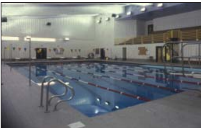
The Baldwin-Wallace College Natatorium is home to Yellow Jacket swimming and diving. The pool is also available to all B-W students and receives use by the community and elderly.

Also in the Rec Center is the B-W Natatorium, home to the Yellow Jacket