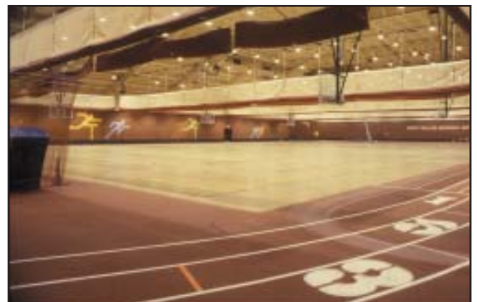
The Harrison Dillard Track in the B-W Fieldhouse is a six-lane, 200-meter oval that has served as the site of many B-W, OAC, high school and amateur championship meets.