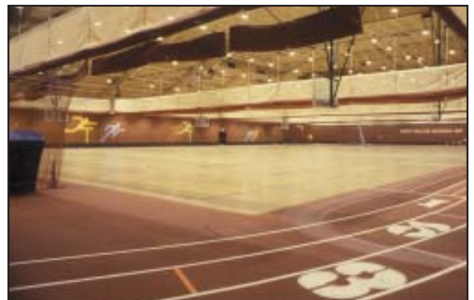
The Harrison Dillard Track in the B-W Fieldhouse is a six-lane, 200-meter oval that has served as the site of many B-W, OAC, high school and amateur championship meets.