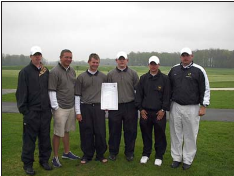
The 2003-2004 Yellow Jacket men placed second at the OAC Championship Tournament and narrowly missed qualifying for the NCAA Division III Tournament.

The 2004-2005 men's golf team has the potential to exceed many expectations and should be a force to reckon with this fall. The Yellow Jackets will begin the fall season September 3-4 at the Olivet (Mich.) College Invitational.