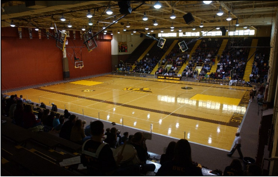
The Ursprung Gymnasium was renovated in 1986 and seats more than 2,800 fans for basketball, volleyball and wrestling. The basketball stands are situated away from the floor with an excellent view from any angle.

a one-meter diving board. The movable pool bottom has adaptive physical therapy applications and can be used by the handicapped.