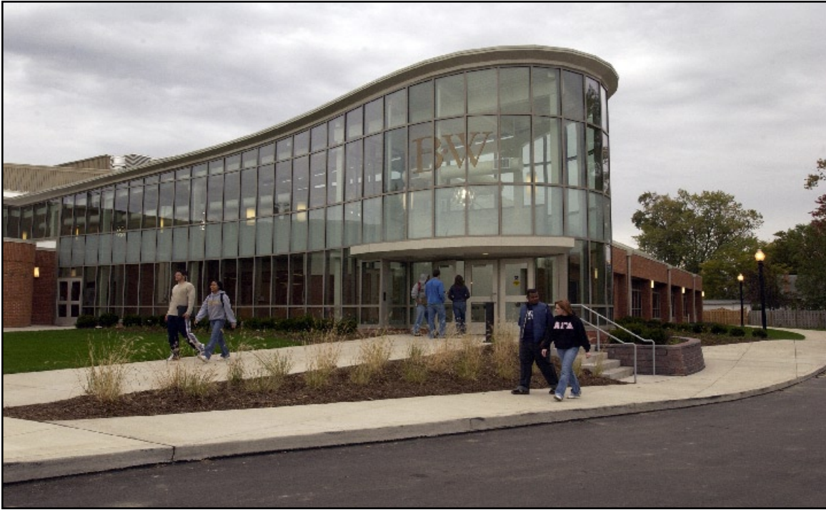
The expanded and renovated Lou Higgins Center is the centerpiece of the B-W athletic facilities. Renovation began during the summer of 2004 and was completed in October 2005. The 170,000 square-foot complex houses the Ursprung Gymnasium, Harrison Dillard Track, natatorium, updated workout and personal fitness spaces, a state-of-the-art athletic training facility, classroom space and offices for coaches and staff.

The Baldwin-Wallace College student is afforded the opportunity to learn, exercise, practice and play in some of the finest facilities in small college athletics. In addition, as a student at B-W, each has an opportunity to use a group of facilities that are unparalleled in Division III athletics.