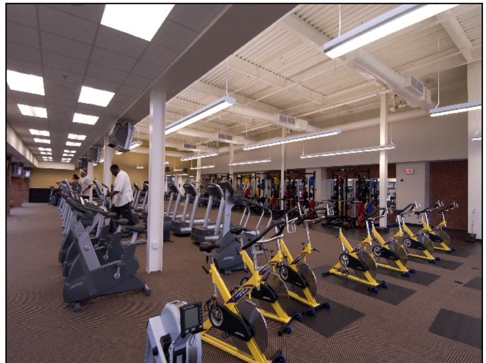
The B-W weight and training rooms also received a facelift as part of the renovations to the Lou Higgins Center. The weight room doubled in size and allows students and athletes have access to new and top-of-the-line exercise equipment.

"It is one of the finest training centers of any small college in the nation," notes Bankson. "We feel the Lou Higgins Center has answered the needs of the B-W community."