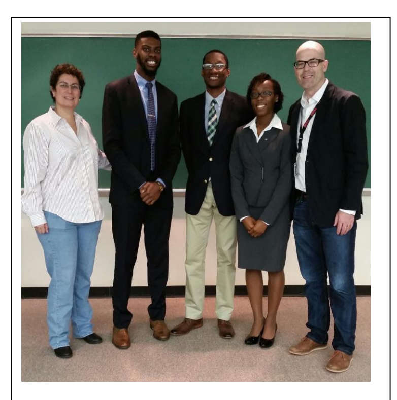
New Nu Rho Psi members from Atlanta University Center Consortium (Morehouse College, Spelman College, Clark Atlanta University, and Morehouse School of Medicine).